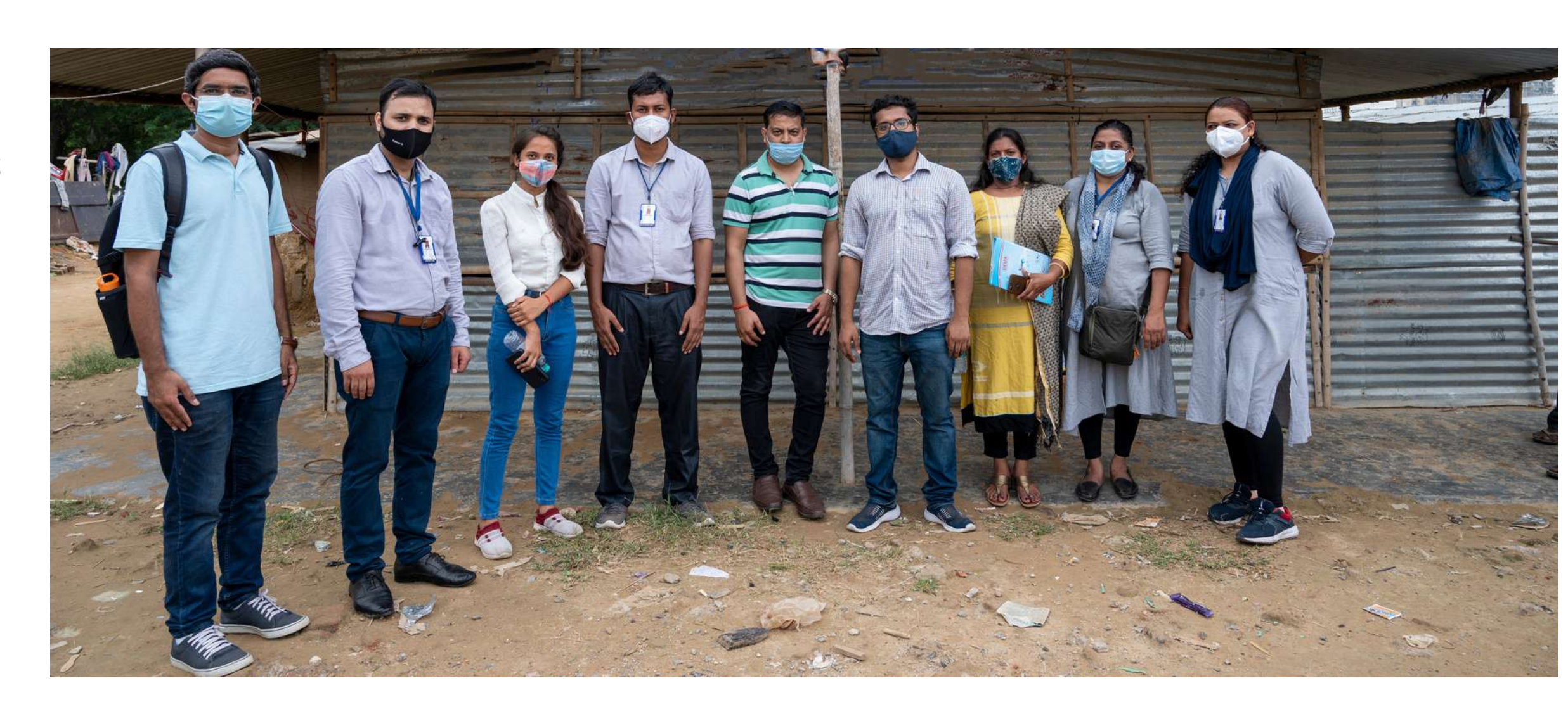
A total of Rs 1,05,451 family savings were enhanced for 170 families through this initiative